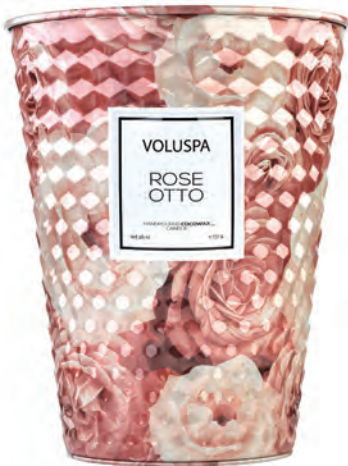
TABLE TIN CANDLE #5331