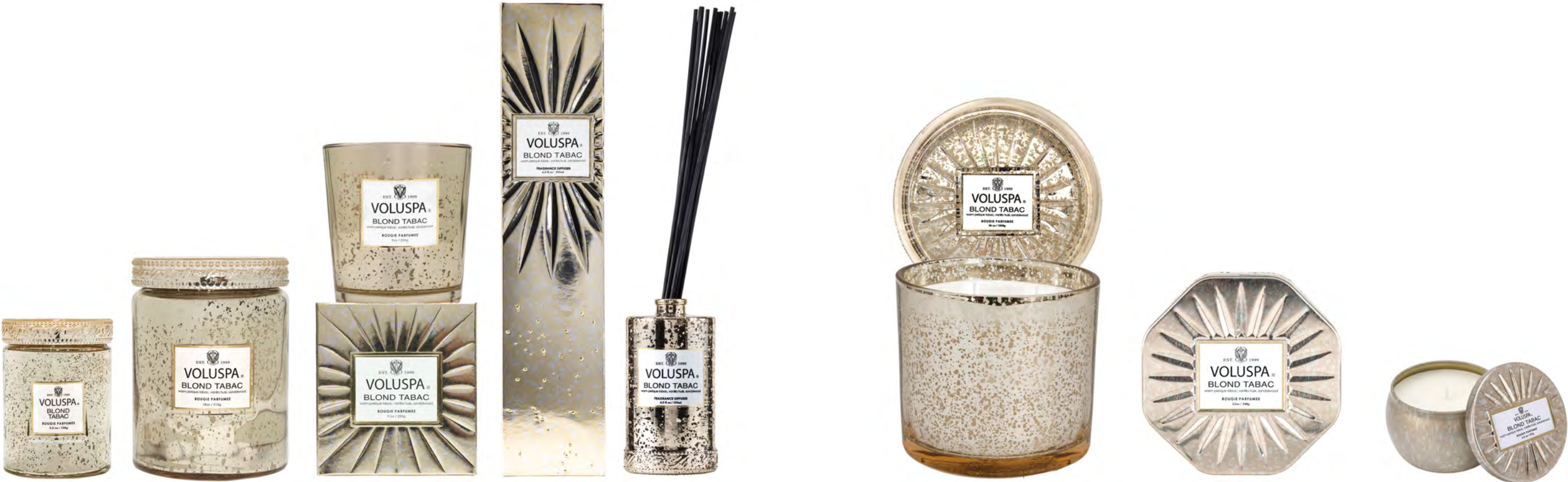
SMALL JAR #6879

Enter the drawing room of contentment with a scent of subtle elegance, reminiscent of tweed smoking jackets and smooth Perique pipe Tobacco. Vanilla Husk curls through Sandalwood paneled club rooms, mellowed by years of pleasure. This isn't a pipe dream, it's an invitation to breathe deeply and join the club of this richly storied scent.