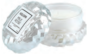
MACARON CANDLE #5305