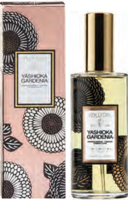
ROOM SPRAY #7275