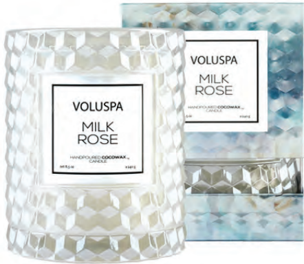
CLOCHE CANDLE #5325