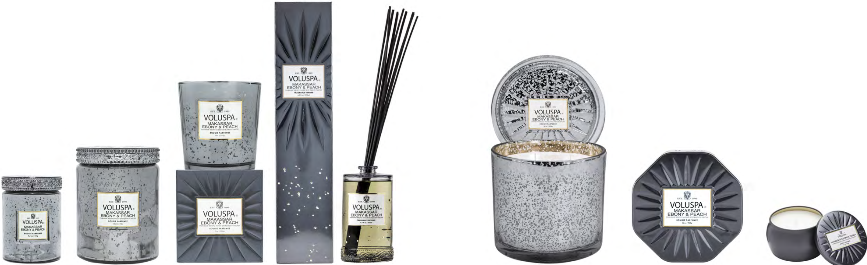
SMALL JAR #6872

Wake in the deep sensual darkness of wood paired with fruit. Inhale the scent of solid Black Ebony and Mahogany with the succulence of ripe Peaches and Apple Blossom. Like discovering an overflowing fruit orchard in the deepest, darkest enchanted forest - imagine this irreverent scent combination, so appealing in its darkly, unexpected, juicy delight. A Voluspa classic, feel free to pick it.