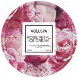
2 WICK TIN #5222