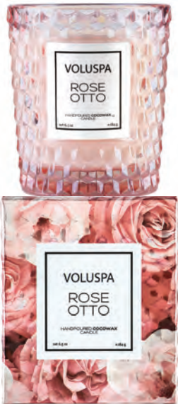
CLASSIC CANDLE #5311