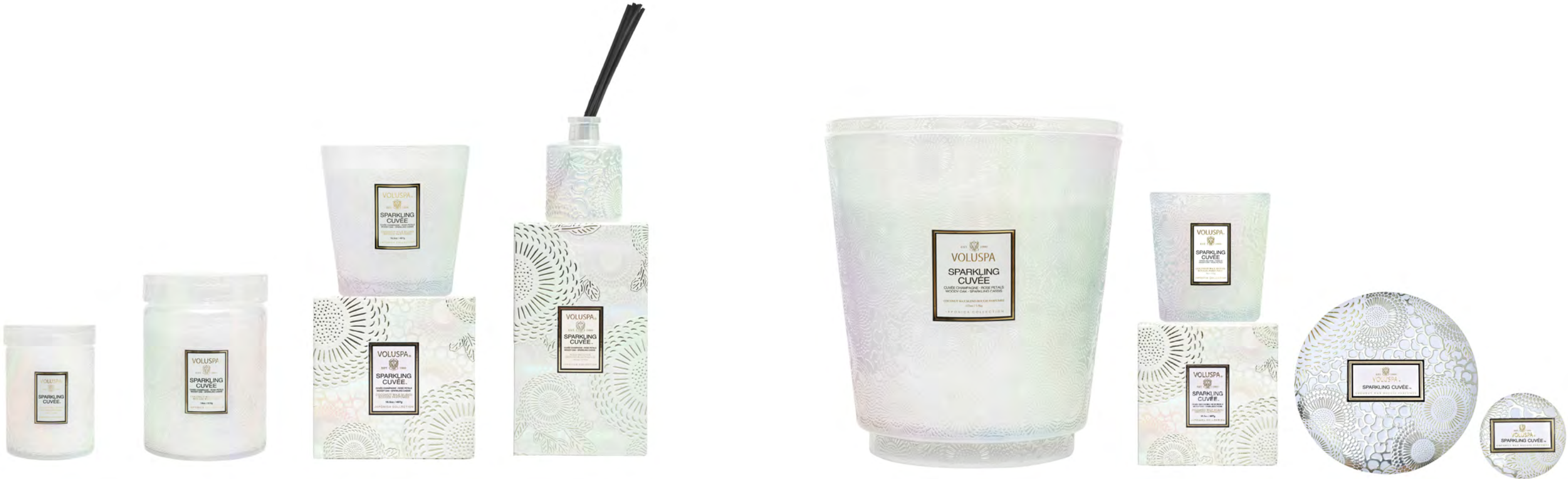
SMALL JAR #73529

Pop a bottle of Voluspa's finest blend, it's time to celebrate! A mix of beautiful aromatic complexity, Sparkling Cuvée opens with vivacious fruit tones of Sparkling Grapefruit, Pomelo and Red Currant. The effervescence of Sparkling Wine is the heart of the celebration, with bubbles cascading to the surface, dancing and mingling with juicy Nectarine and Bulgarian Rose Petals. A velvety, smooth finish of Barrel Oak serves as the perfect stage for this aromatic affair. Raise a glass of Sparkling Cuvée, your olfactory aperitif for every unforgettable occasion.