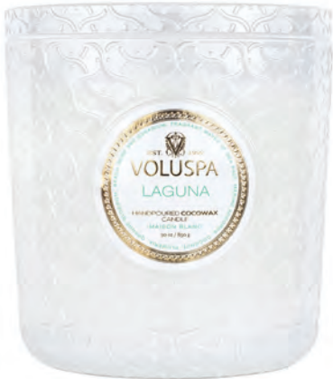
LUXE CANDLE #8133