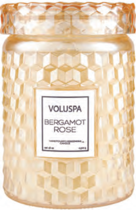
LARGE JAR #5354