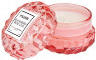
MACARON CANDLE #5306

Under a grove of Citrus and Figs, Rose vines tangle with Berry vines. As flowers and fruit bloom, they collide in an intoxicating burst of sophisticated fragrance.