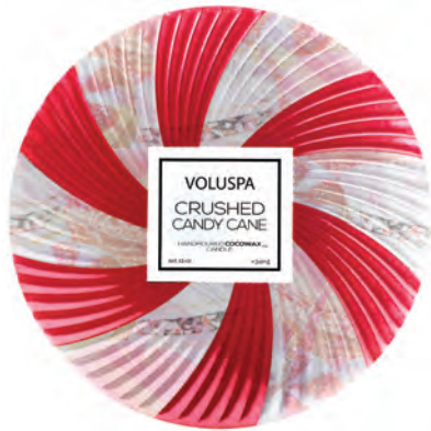
3 WICK TIN #5456