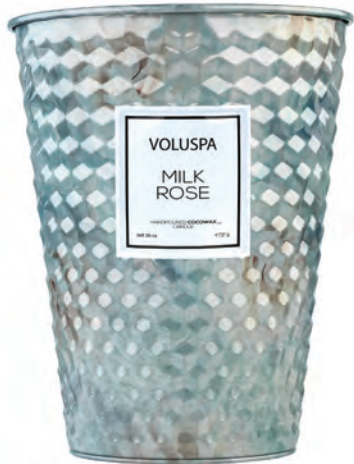
TABLE TIN CANDLE #5335