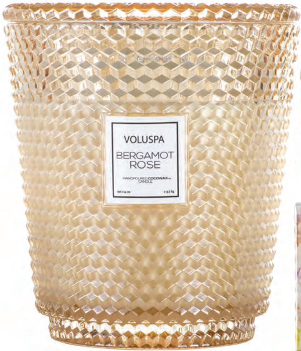
5 WICK HEARTH #5384