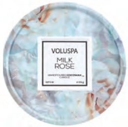
2 WICK TIN #5225