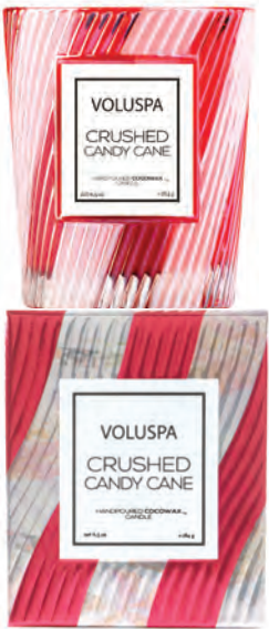
CLASSIC CANDLE #5416