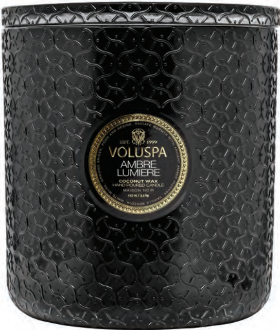
5 WICK HEARTH #8502 LAUNCHING Q1 2023