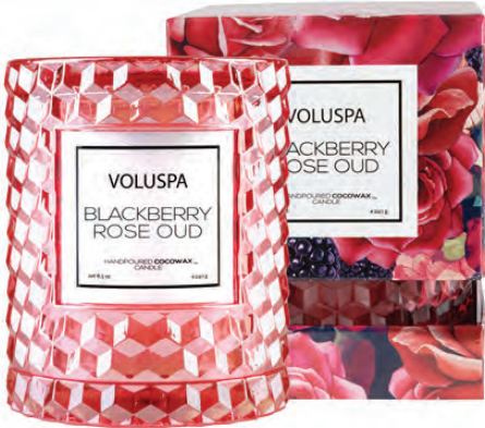
CLOCHE CANDLE #5326