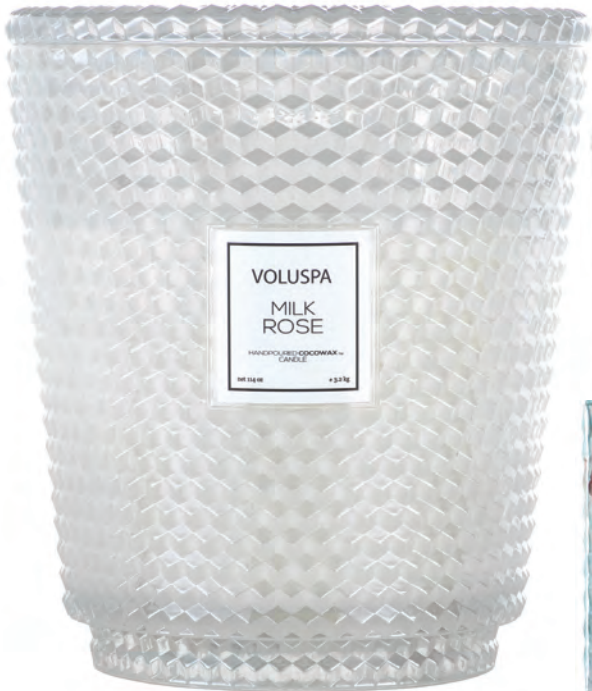
5 WICK HEARTH #5385