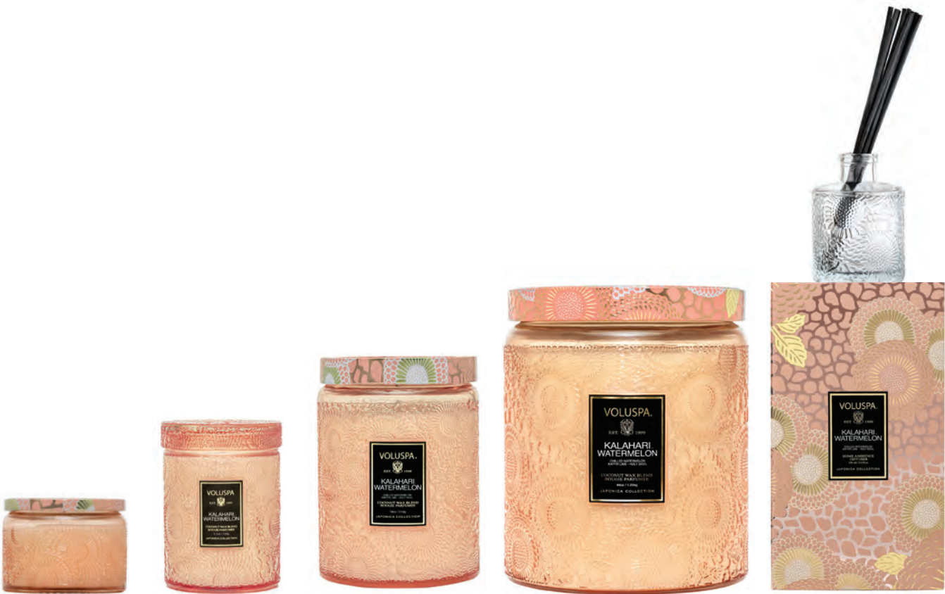
PETITE JAR #72427