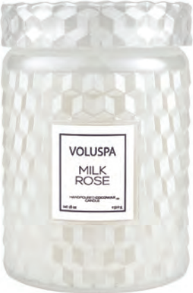
LARGE JAR #5355