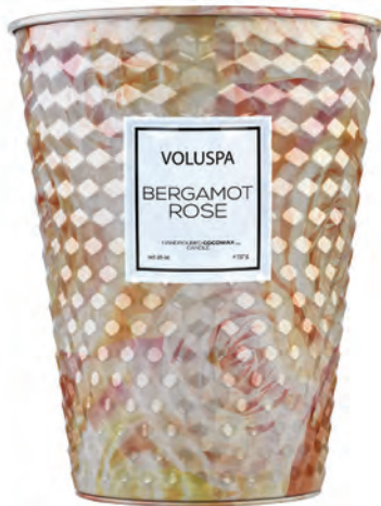
TABLE TIN CANDLE #5334