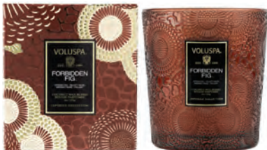
9oz CLASSIC CANDLE 9 oz / 255g • Burn Time: 60 hr This stunning Classic Candle is wrapped in our iconic Japonica pattern with a sleek tapered edge, packaged in a decorative box with metallic accents. *Tester Format Available