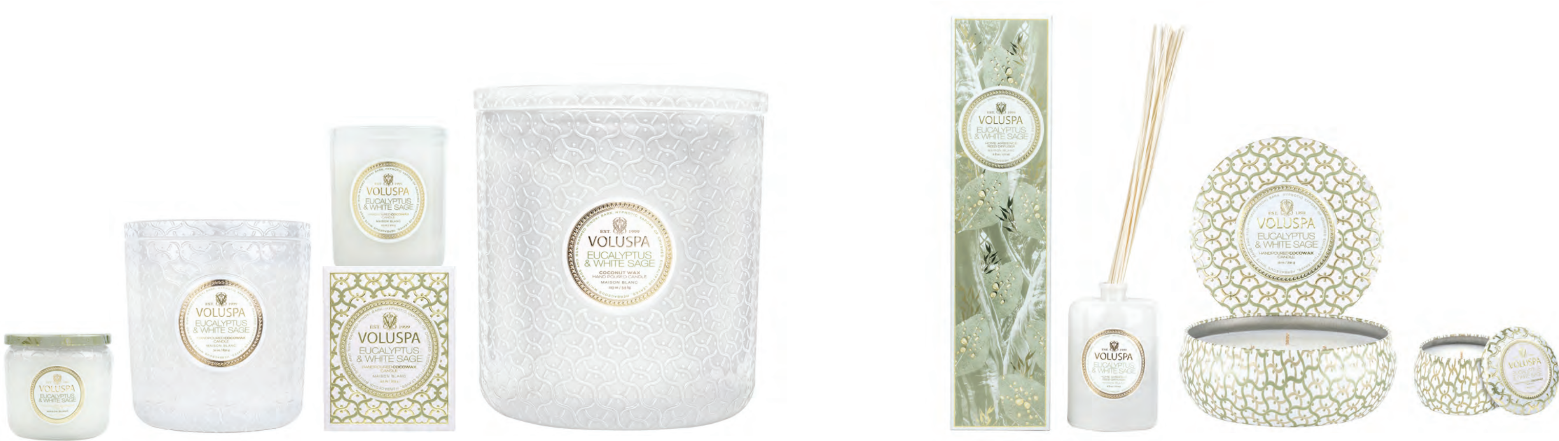
PETITE JAR #8147

Breathe in... and out. Rejuvenate your body and soul with the hypnotic vapors of Eucalyptus and White Sage, giving way to mystical soothing properties. Let worries fade away with this aromatic sun salutation. Notes of crushed Eucalyptus leaves, Cardamom, herbaceous White Sage, and sun-warmed Hinoki Bark create a kinship of peace and vitality, illuminating feelings of renewal. Make Voluspa's Eucalyptus & White Sage part of your daily routine. Namaste.