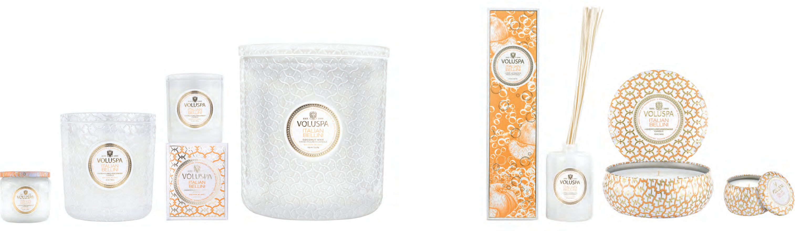
PETITE JAR #8146

Drink in the effervescent scent of iconic sparkling Champagne - a cocktail of fresh white Peach, pureed with Berries and delicate Rosewater. This festive scent says "Cheers!" transforming a lackluster day into a celebration in its own right.