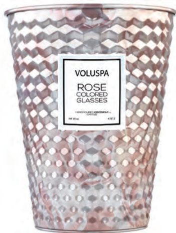
TABLE TIN CANDLE #5333