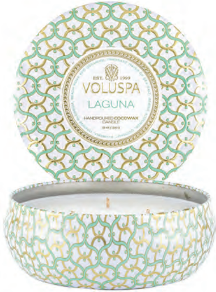
3 WICK TIN #8123