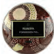
MINI TIN CANDLE 4 oz / 113g • Burn Time: 25 hr A petite candle in a decorative metal container. Perfect for travel or sprinkled around the home.