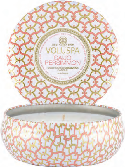
MINI TIN #8112