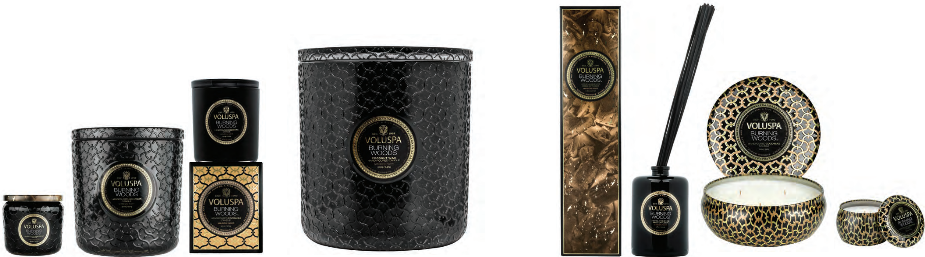
PETITE JAR #8247 LUXE CANDLE #8237 CLASSIC CANDLE #8207 5 WICK HEARTH #8507 REED DIFFUSER #8257 3 WICK TIN #8227 MINI TIN #8217

A rich warming accord with top notes of aromatic cut wood from Fir Balsam and Himalayan Juniper freshly gathered on a glowing hearth of Herbal Sage, Smokey Cade, and Burning Woods. Enhanced by enticing tonalities of Embers, warm Patchouli Mist, and Cedarwood. Elevate your space with the scent of Burning Woods.