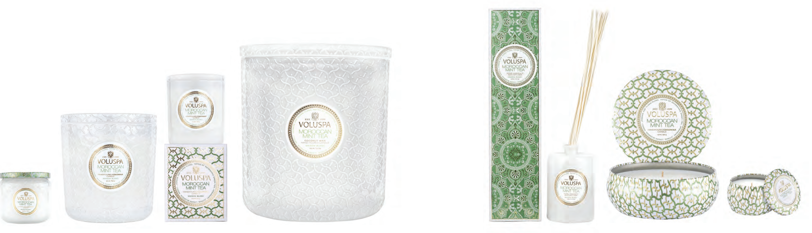
PETITE JAR #8144

Welcoming relief from the desert heat, Moroccan Mint Tea blends crisp, cool Citrus and green Spearmint with an intriguing floral heart of Linden Blossom, Neroli, Jasmine and Ylang Ylang. Instantly invite in serenity with a hint of pleasant euphoria.