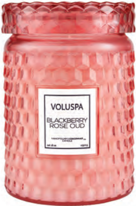
LARGE JAR #5356