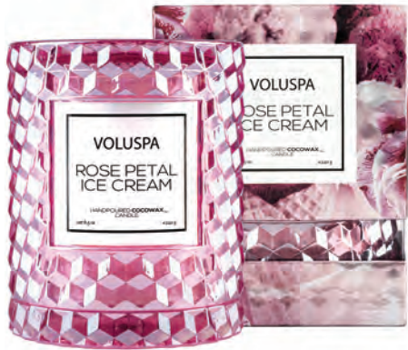
CLOCHE CANDLE #5322