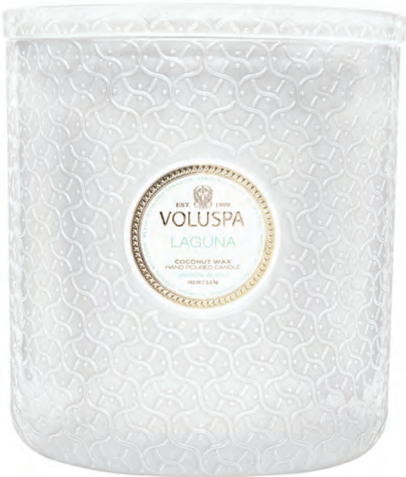
5 WICK HEARTH #8403