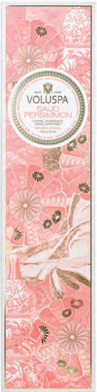
REED DIFFUSER #8152