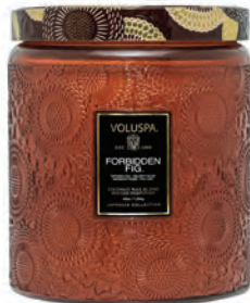
NEW! LUXE CANDLE 44 oz / 1.2kg • Burn Time: 140 hr The iconic large jar has leveled up, twice the size and wicks, burning for 140 hrs. Add a statement piece to your home, while filling it with your favorite Voluspa fragrance.