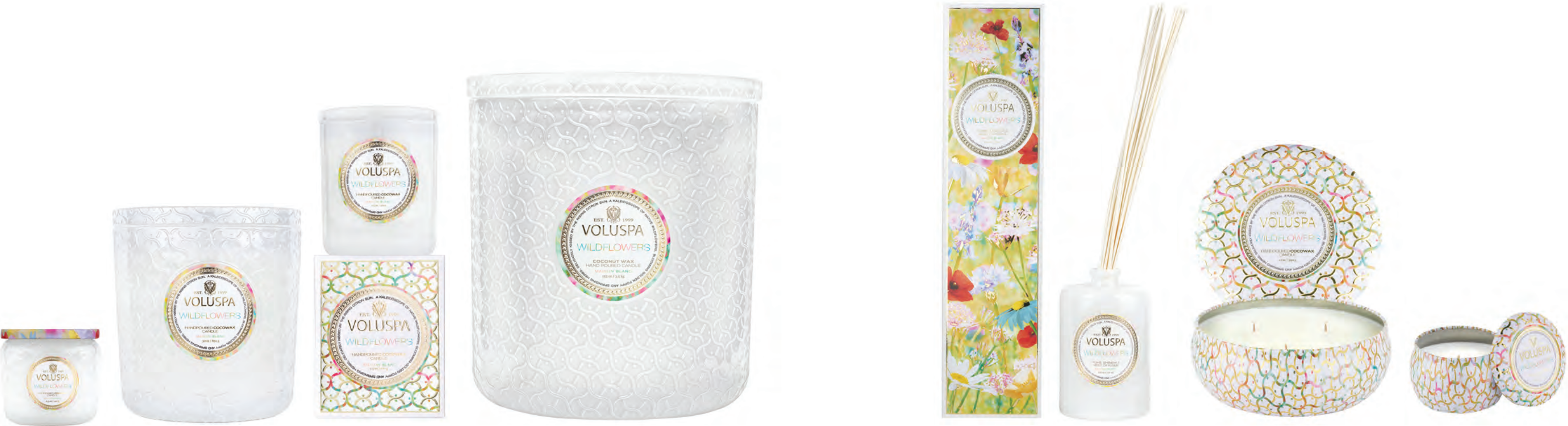
PETITE JAR #8148

You've been called to dance among the wildflowers, losing yourself in the beauty of this unruly floral sea. Lightly pass your hand over a kaleidoscope of Native Wildflowers, blooming Golden Poppy, Ambrosia and springing Herbs; sugared by misty vapors of Blue Agave and delicately kissed by the rising Citron sun. Gently coax this fragrant super bloom of Voluspa's Wildflowers.