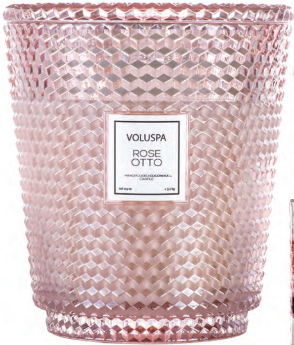
5 WICK HEARTH #5381