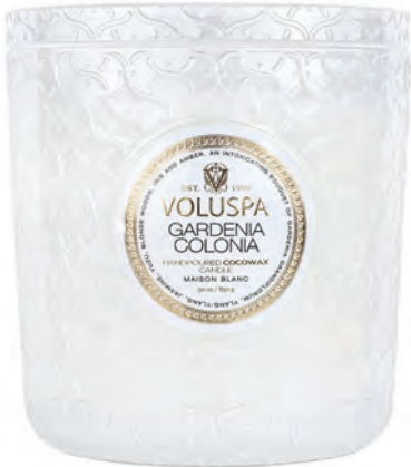
LUXE CANDLE #8135