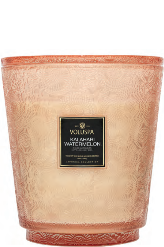
5 WICK HEARTH #72827