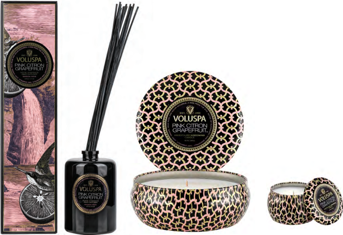
REED DIFFUSER #8255