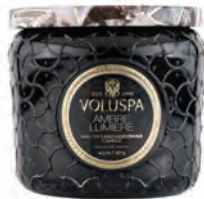
PETITE JAR #8242

The earth's treasure comes to light in a mystical, aromatic meditation based on ancient Amber Incense, precious ceremonial Burning Wood, Ground Spices, Pods and Resins; all used for centuries to arouse the senses and soothe the soul. The aromatic radiance of this timeless scent instills a sense of calm, welcome, and well-being. VOLUSPA Ambre Lumiere: Reflect warmth in home and in spirit.