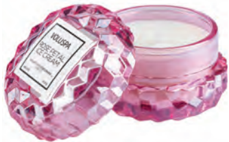
MACARON CANDLE #5302

A confectioner's twist on a classic Rose scent, this heady aroma of Sugared Rose Petals swirl with tart Raspberry, Almond, Marshmallow, and Vanilla Bean Ice Cream goes well beyond a childhood treat.