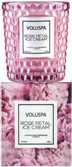
CLASSIC CANDLE #5312