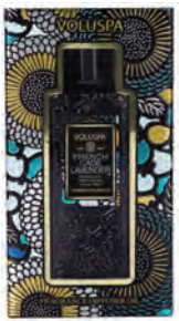
FRENCH CADE LAVENDER French Cade Wood, Verbena & Bulgarian Lavender SKU 7414