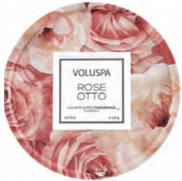
2 WICK TIN #5221