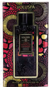
GOJI TAROCCO ORANGE Goji Berry, Ripe Mango & Tarocco Orange SKU 7411

Voluspa fragrances are uniquely sourced from around the globe, blending sustainable ingredients, fine fragrance and essential oils. Transform your space and live life in color with Voluspa's ultrasonic Fragrance Diffuser Oil, captured in a luxe decorative bottle. For the optimal home fragrance experience, add 5 to 10 drops of oil to your device. Control fragrance intensity by adjusting the amount of drops to achieve your preferred ambient scent. Turn on and transform your space.