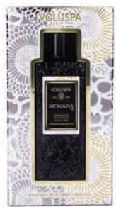
MOKARA Mokara Orchid, White Lily & Spring Moss SKU 7418