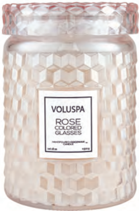
LARGE JAR #5353