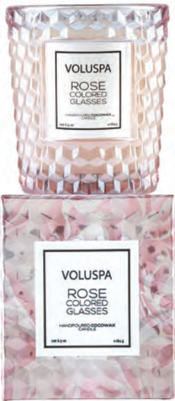
CLASSIC CANDLE #5313