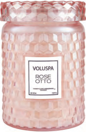
LARGE JAR #5351