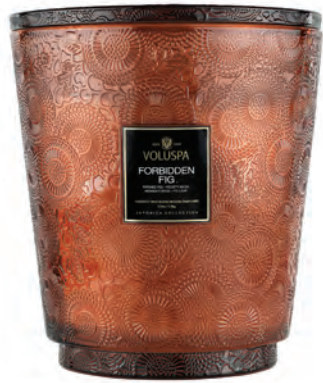
5-WICK HEARTH CANDLE 123 oz / 3.5kg • Burn Time: 250 hr Our largest format! A gorgeous 5-wick glass candle embossed in the iconic Japonica wood block pattern. Topped with an elegant glass lid that doubles as a base.