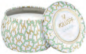
MINI TIN #8113