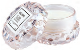
MACARON CANDLE #5303

The sweet scent of Pink Rose Petals, Neroli Blossom and warm Vanilla cast a cheerful and optimistic glow, putting everything in its best light- like wearing Rose Colored Glasses.