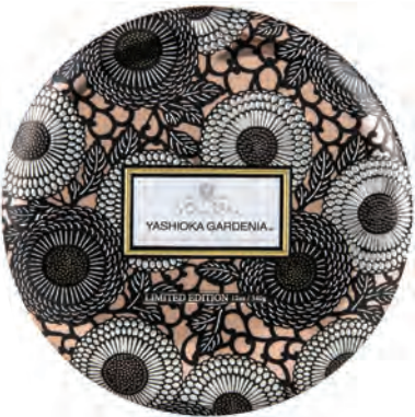
3 WICK TIN #7225