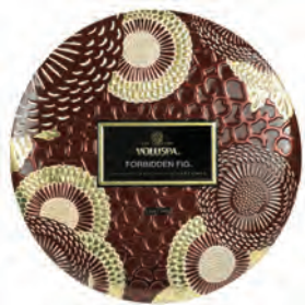
3 WICK TIN CANDLE 12 oz / 340g • Burn Time: 40 hr A graceful urn-shaped container features triple wicks that creates a generous melted wax pool when in use.