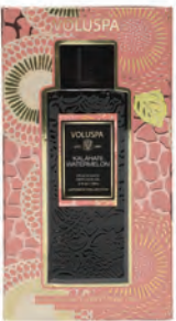
NEW! KALAHARI WATERMELON Chilled Watermelon, Pressed Lime & Holy Basil SKU 74127