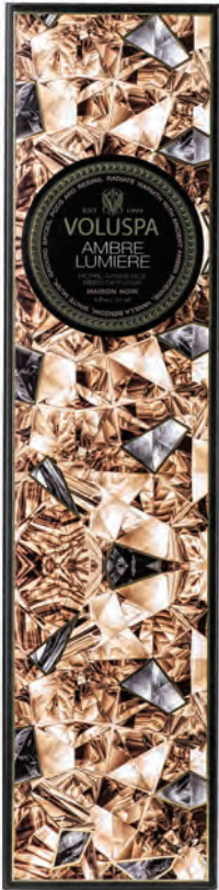
REED DIFFUSER #8252