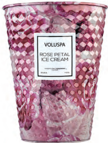
TABLE TIN CANDLE #5332