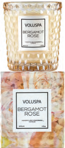
CLASSIC CANDLE #5314