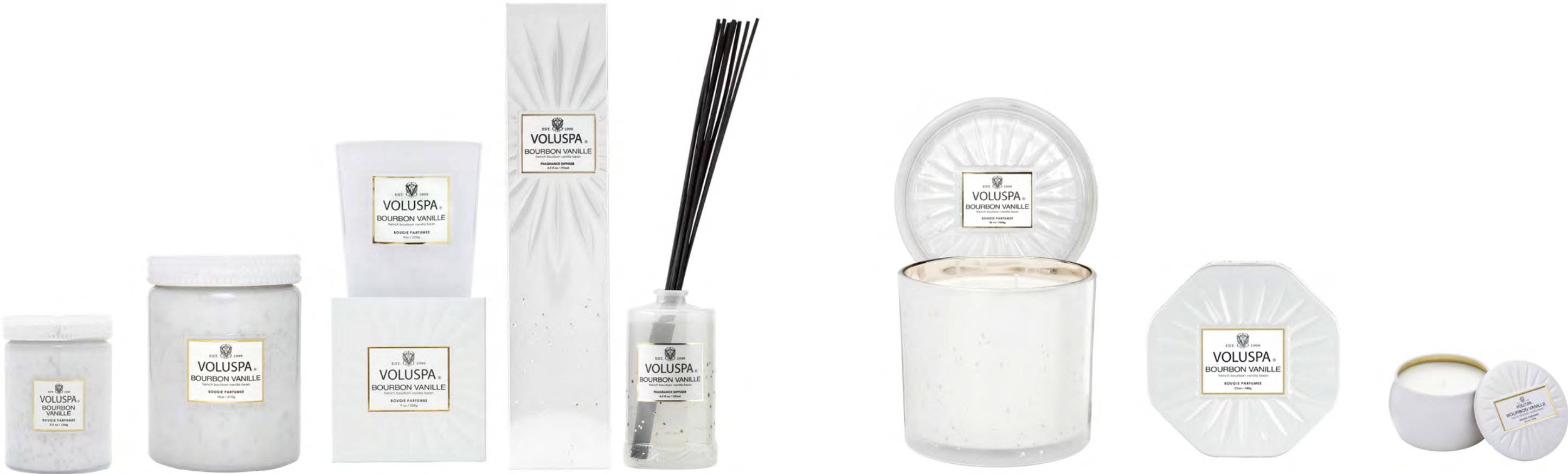
SMALL JAR #6874

Heat up your comfort zone with the decadence of French Bourbon Vanilla, far beyond the realm of the kitchen. Sultry, sensual and sophisticated Vanilla Bean Pulp is an invitation to give in to all temptation for the Vanilla connoisseur, as its rich scent warms and envelops the atmosphere, tantalizes the senses and inspires and arouses appetites in every room of the house.