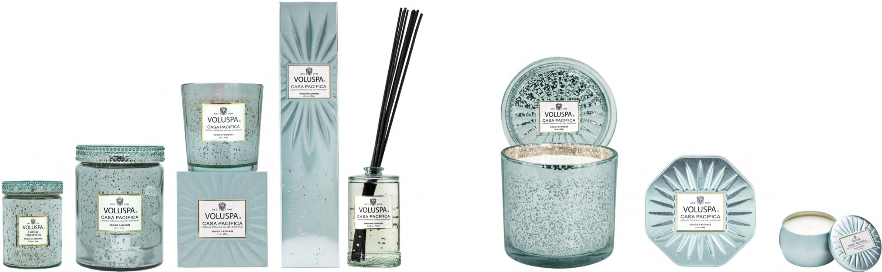
SMALL JAR #6877