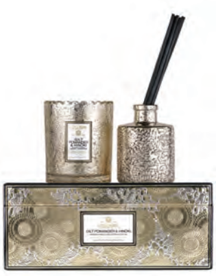
GILT POMANDER & HINOKI #72933