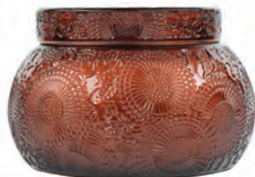
CHAWAN BOWL CANDLE 14 oz / 397g • Burn Time: 50 hr Inspired by a ceremonial tea bowl, this beautiful lidded glass candle is wrapped in the elegant embossing of Japonica Pattern. *Not available in Kalahari Watermelon