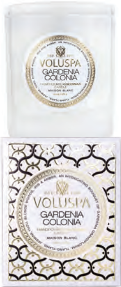
CLASSIC CANDLE #8105