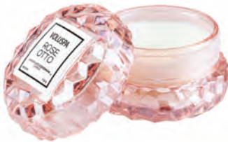
MACARON CANDLE #5301

Enter the Rose garden without thorny consequence. Rosa Damascena, Bulgarian Rose and Peony evoke their perfume in sweet harmony.