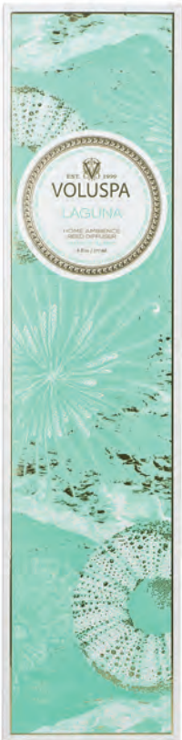
REED DIFFUSER #8153