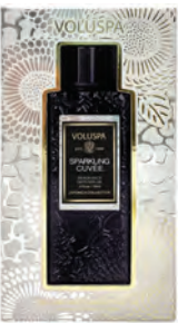
NEW! SPARKLING CUVÉE Sparkling Wine, Pomelo, Woody Oak & Rose Petals SKU 74129