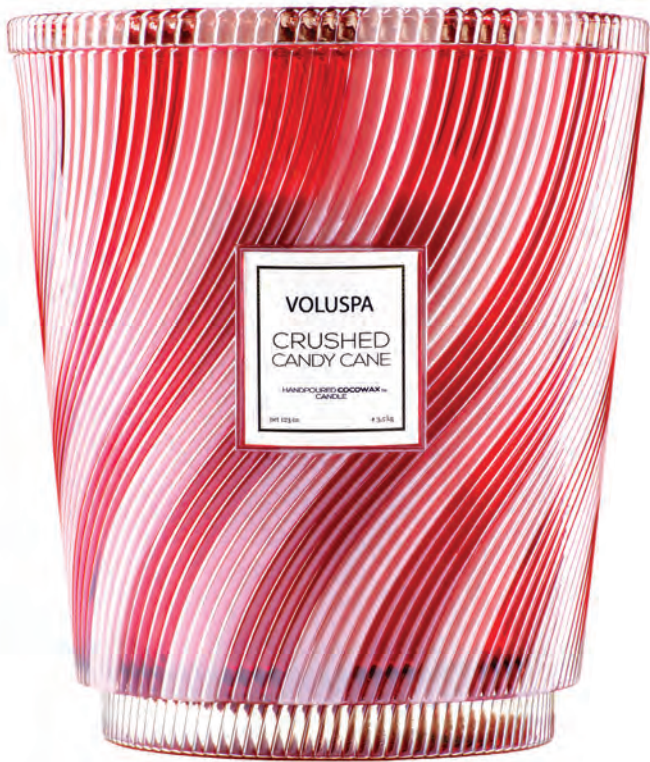
5 WICK HEARTH #5486