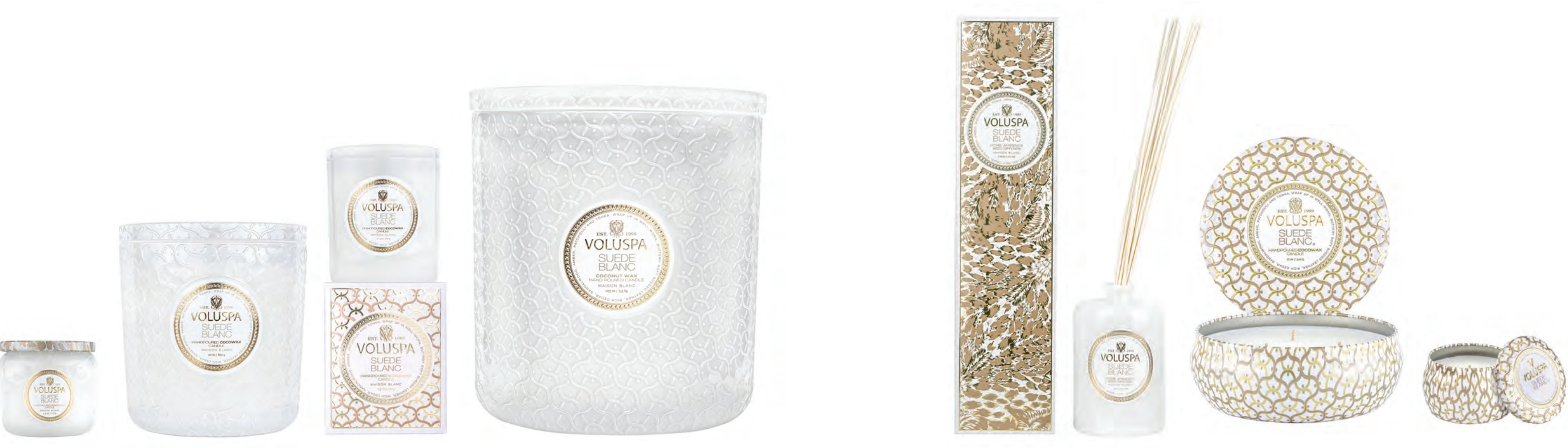
PETITE JAR #8141

Wrap up in a jacket of soft, supple well-worn Suede; Low-key, mellow, infinitely smooth. Its sultry caress envelopes one and all in a veil of smooth sensuality, delivering comfort to any atmosphere.