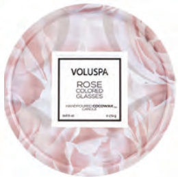
2 WICK TIN #5223