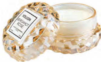
MACARON CANDLE #5304

Uplifting Rose mingles with radiant Bergamot, Honeysuckle and Orange Blossom for playful, whimsical moments in a free-spirited scent meant for daydreaming.