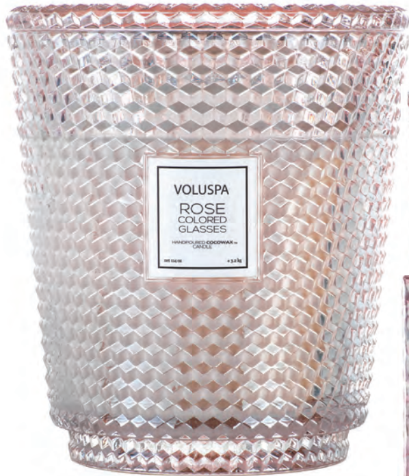
5 WICK HEARTH #5383