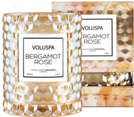
CLOCHE CANDLE #5324