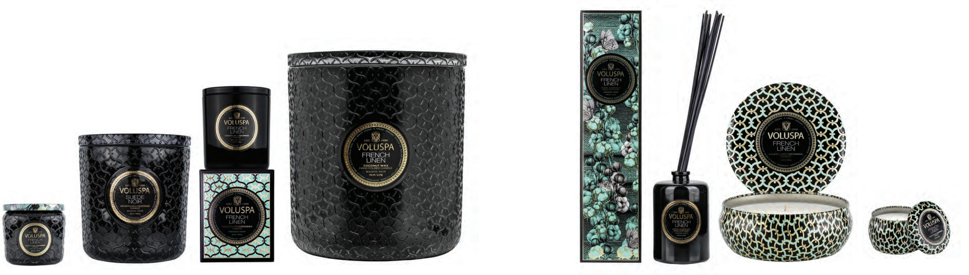
PETITE JAR #8244