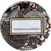
MINI TIN #7215