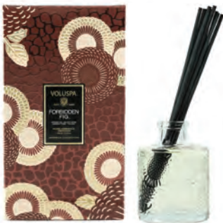
REED DIFFUSER 3.4 fl oz / 100ml • Product Life: 4-6 mo Designed using 10 fine-gauge rattan reeds to increase fragrance distribution. *Tester Format Available