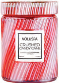
SMALL JAR #5476