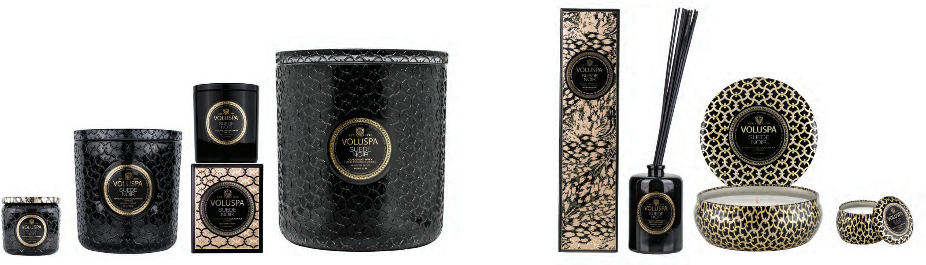
PETITE JAR #8243

Night covers day with a shaded embrace in a lush excursion into a complex, yet smooth sensuality. Distant lights flicker against a velvet midnight sky, the cool night air exudes a profusion fleeting scents: Vintage Dark Suede, burning Palo Santo, traces of Patchouli, trails of smoky Hemp, Tobacco and the softly rising Vanilla Moon... All is delicately hushed like the familiar mellifluous voice on an old vinyl record.