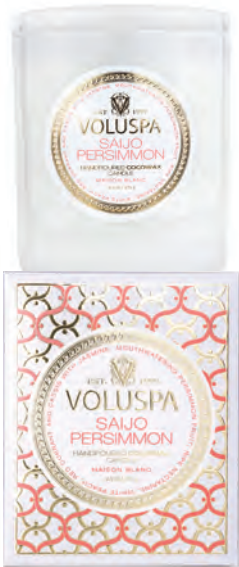
CLASSIC CANDLE #8102