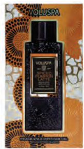
NEW! SPICED PUMPKIN LATTE Kabocha Pumpkin, Vanilla Marshmallow, Coconut Crema & Cinnamon Spiced Brûlée SKU 74121