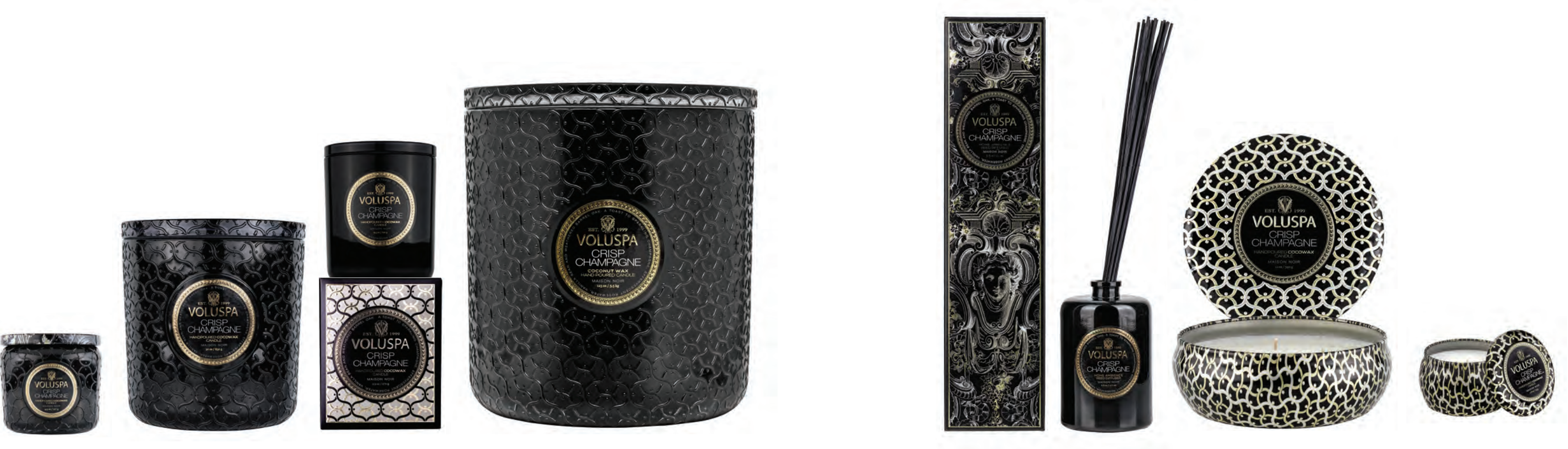
PETITE JAR #8241

Just before a bottle of Champagne is uncorked, there is a moment of exquisite excitement and anticipation, then: POP! The first sip, a Brut tickle of chilled bubbles, effervescent and crisp, sparkling with the aroma of Vanilla, Apples and Peaches from a cool wooden cask. It is this perfect instant, so giddy with promise and possibility, to which homage is paid by VOLUSPA Crisp Champagne. Make every day an occasion to toast yourself or someone you love.