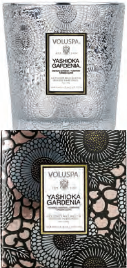
CLASSIC CANDLE #7345