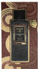
NEW! FORBIDDEN FIG Ripened Fig, Velvety Musk, Midnight Rose & Fig Leaf SKU 74125