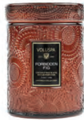
SMALL JAR CANDLE 5.5 oz / 156g • Burn Time: 50 hr Your favorite scent in a darling mini format. Voluspa's custom designed Small Jar Candle is embossed from top to bottom in the iconic Japonica wood block pattern.