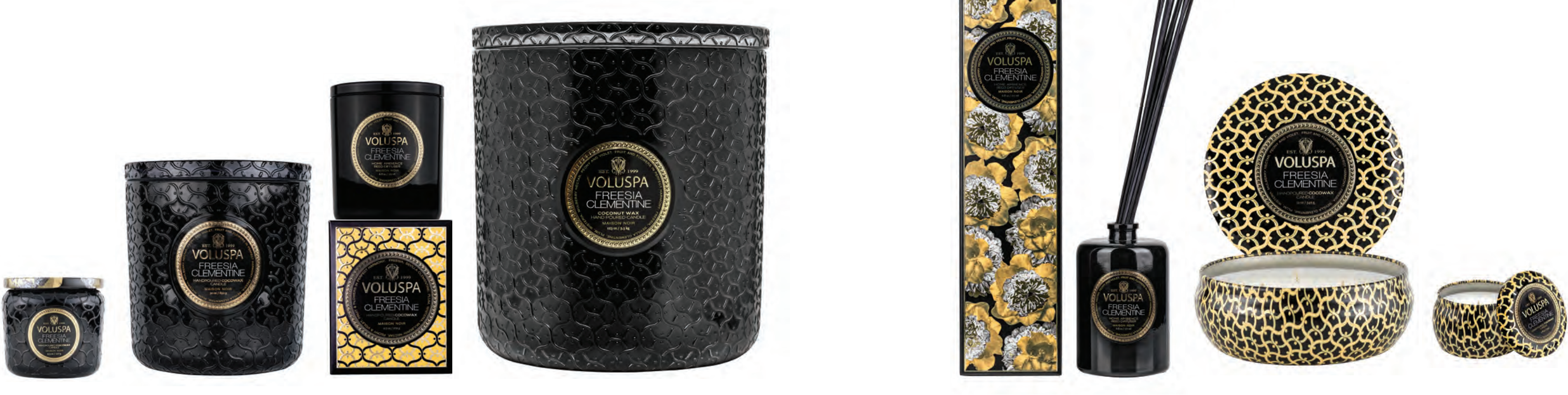
PETITE JAR #8246

The performance opens with the clear and vibrant voices of the illustrious Sevilla Clementine, Mulberry Nectar and California Plum. This dazzling fruit is joined in chorus by Freesia, Pink Wisteria, and Chinese Peony, the renowned harmony trio forming the floral heartbeat of the ensemble. Enhancing this symphony of scent are featured soloists: Blue Lotus, Mirabelle and Violet, each adding classic color to the blossoming melody. This superbly dynamic group of performers broadcasts a masterful composition of vivid, fruit and floral pageantry.