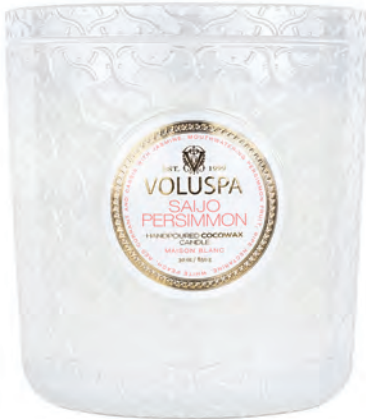
LUXE CANDLE #8132