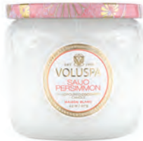
PETITE JAR #8142

A sweet liaison of pulpy, fresh Persimmon engaged in a fruity and delicious flirtation as Nectarine, Peach, Red Currant and Cassis fall under its fragrant thrall. Billowing bouquets of White Jasmine offer the ultimate mouth-watering, pick-me up scent. This fruity, fragrant fling has the makings of a passionate, long-lasting love story.