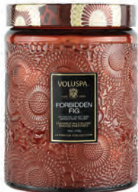
LARGE JAR CANDLE 18 oz / 510g • Burn Time: 100 hr A Japonica best-seller! Featuring our custom embossed glass wrapped in the iconic Japonica pattern. Featuring a decorative tin lid that can be used to extinguish the candle and keep dust free when not in use.