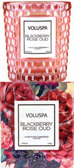
CLASSIC CANDLE #5316