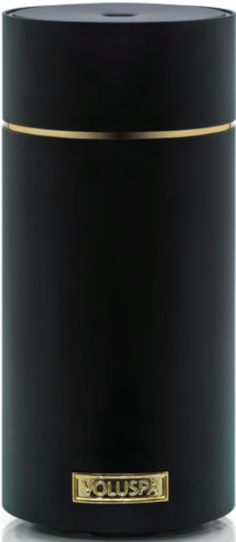
BLACK FRAGRANCE OIL DIFFUSER SKU 74103 Tank Size: 50 mL • Diffusing Capacity: 500sq ft

Voluspa's Fragrance Oil Diffuser was designed with simplicity in mind to enhance any atmosphere. The silhouette masters the elegance of symmetry and is built to last. Anchored by a weighted metal body and styled in the signature Voluspa manner, it features chrome gold embellishments and a black or white finish. The experience is as flawless as the design— a simple one-button operation that instantly uplifts the mood and ambience of your space. The diffuser is rechargeable and portable, with no need to hassle with cords, allowing your favorite fragrances to move freely with you, serving as the olfactory soundtrack to your life.