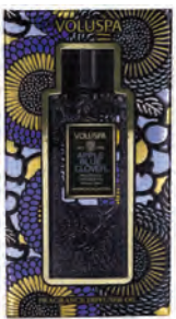
APPLE BLUE CLOVER Andean Blue Clover, Apple & Oak Moss SKU 74124