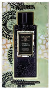
NEW! WHITE CYPRESS White Cypress, Juniper Berry, Mint Leaves & Evergreen Wood SKU 74119