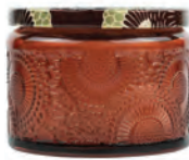
PETTIE JAR CANDLE 3.2 oz / 90g • Burn Time: 25 hr The custom embossed Japonica glass candle comes complete with coordinating metal lid. Great for small spaces or travel!