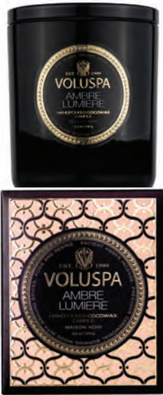
CLASSIC CANDLE #8202