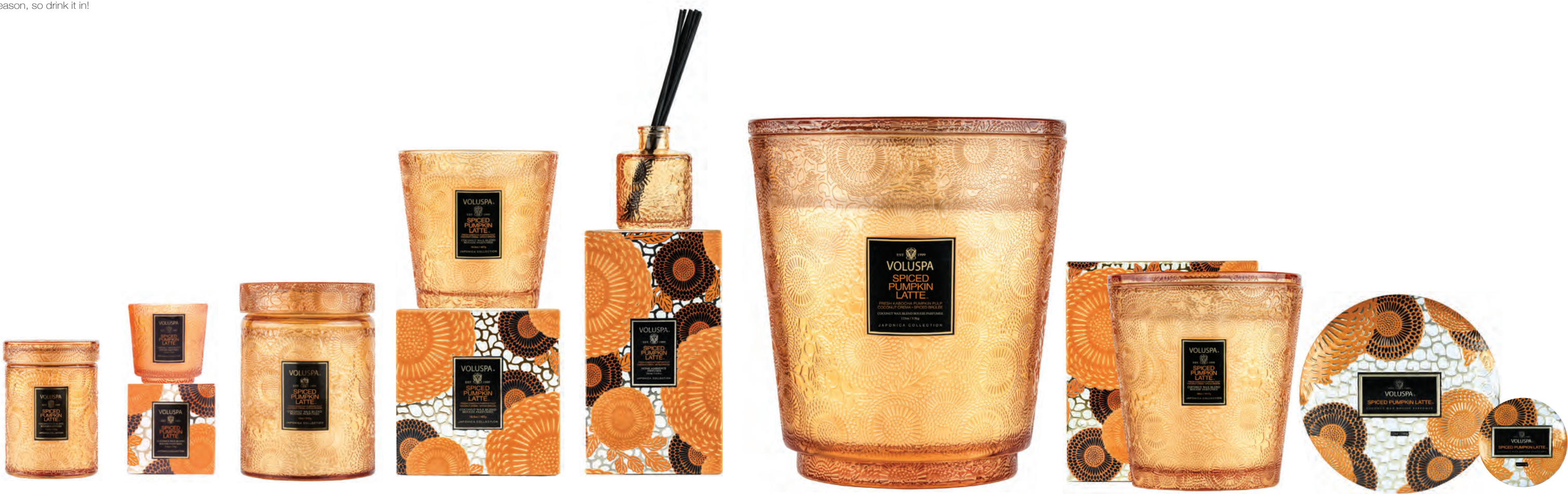
SMALL JAR #73521 MINI PEDESTAL # 73921 LARGE JAR #73321 2 WICK HEARTH #73621 REED DIFFUSER #72521 5 WICK HEARTH #72821 3 WICK HEARTH #73821 3 WICK TIN 72221 MINI TIN #72121

Invite the warmth of the season into your home with our Holiday Exclusive, Spiced Pumpkin Latte- where fresh pumpkin is brewed with the warmest of spices: starring Cinnamon, Ginger, Cardamom, and Clove. Creamy, luxurious Coconut Milk permeates the blend, with just a kiss of fluffy Vanilla Marshmallow and delicious Bruléé tops it all off with a delicate, sweet touch. It's the scent of the season, so drink it in!