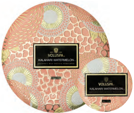
MINI TIN #72127