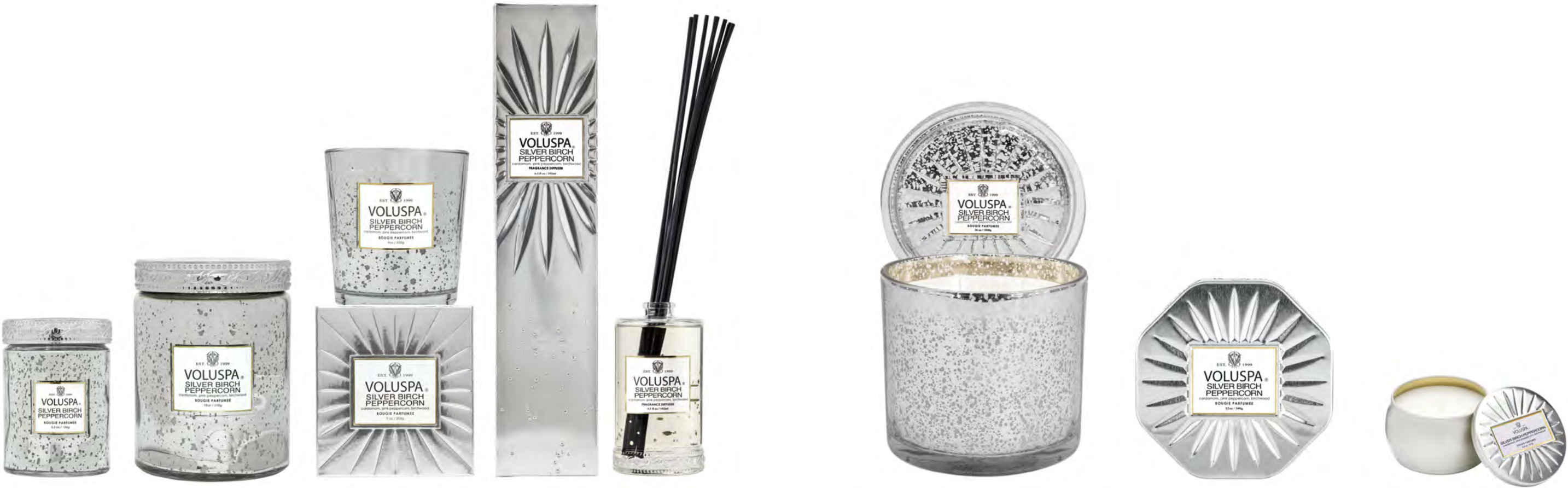
SMALL JAR #68718

The crisp winter air sends fallen leaves as invitations to stoke the fire within. Spicy nuances of hulled Guatemalan cardamom and fine tobacco mist lend a spark of intrigue, uncovering the mysterious ornamental Pink Peppercorn draped among the snow-topped evergreens. Don't wander too far as the sweet comforts of honey, tonka bean and delicate woods cast warmth on your surroundings, inviting you to settle into its comforting glow.