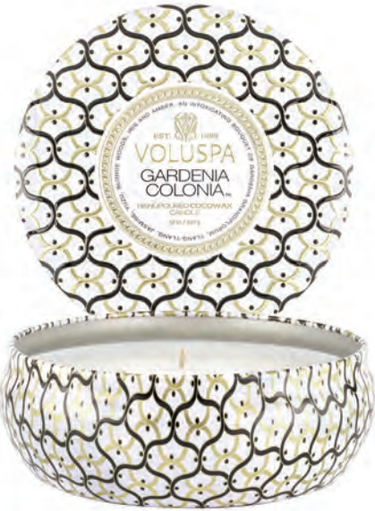
3 WICK TIN #8125