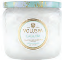
PETITE JAR #8143

Catch this wave and sink into the sensation of sunshine and Sea Salt spray. Fresh Marine gives way to shoreline mist with a gentle ripple, while garlands of Plumeria blossoms, Island Gardenia, Orange Blossom and Coconut Palms sway through the cloudless, azure sky. It's always a day at the beach.