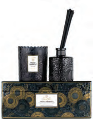
MOSO BAMBOO #72930