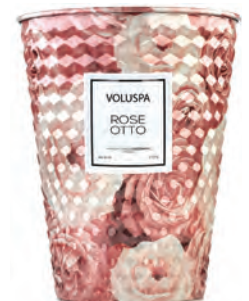
TABLE TIN CANDLE

114 oz / 3.2kg • Burn Time: 200 hrs Our largest format! A 5-wick gorgeous glass candle embossed with a classic 3D geometric cube pattern, colored to match the rose-inspired fragrance and packaging.