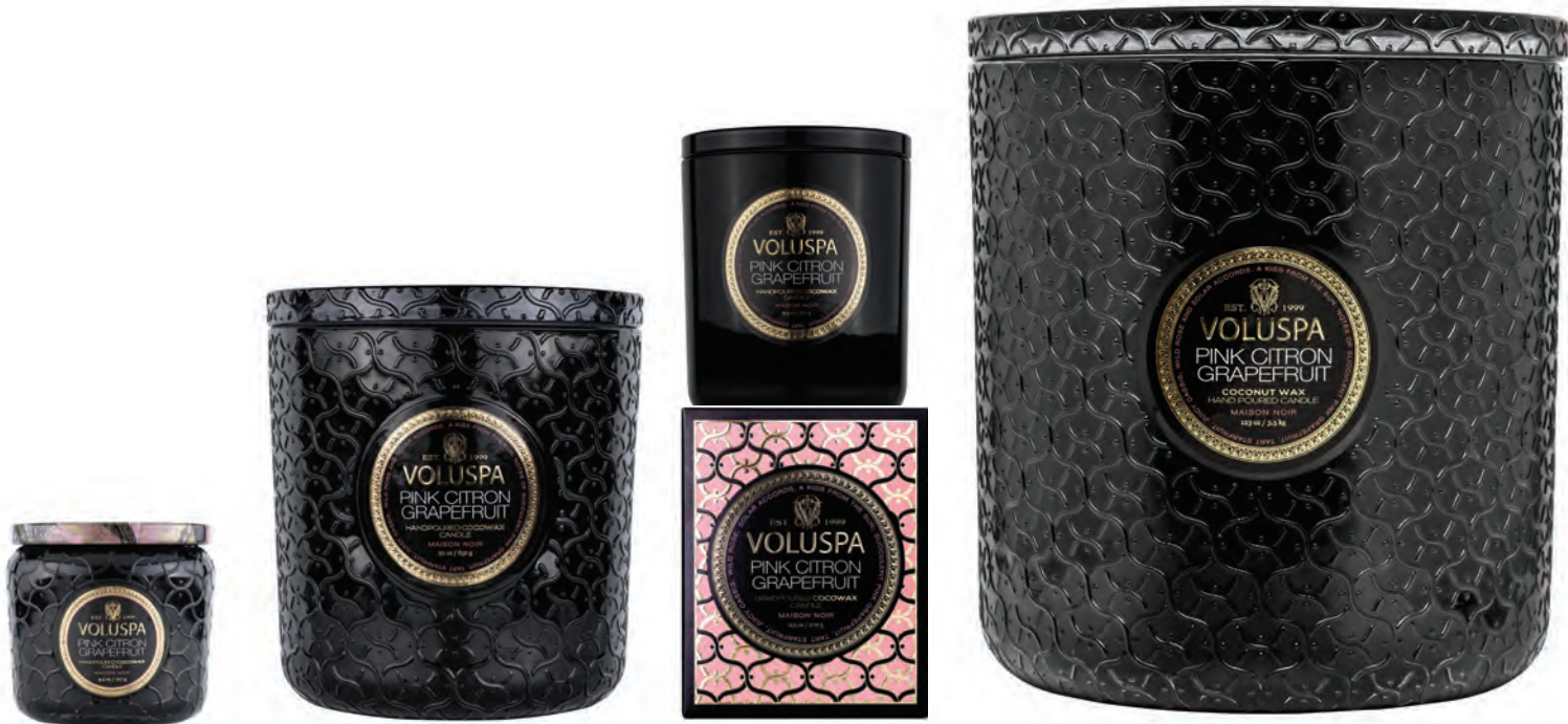
PETITE JAR #8245

Pucker up for a kiss from the sun! Fall in love with an explosion of exuberantly ripe Pink Grapefruit and succulent Starfruit flourishing in a lavish, natural orchard habitat, awaiting harvest. Caressed by wild Rose bushes and abundantly lush Cassis Berry vines; VOLUSPA Pink Citron Grapefruit is a classic ray of light, and always in good taste. It's positively mouth-watering. Let the sunshine in.