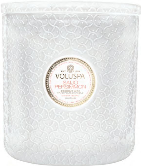
5 WICK HEARTH #8402