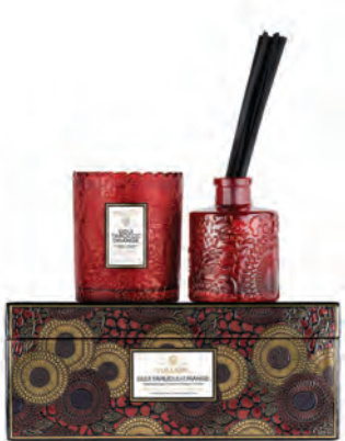
GOJI TAROCCO ORANGE #72931