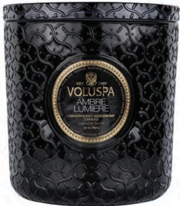
LUXE CANDLE #8232