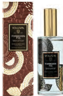
ROOM & BODY SPRAY 3.4 fl oz / 100ml This lustrous glass container is filled with a fragrance you can mist wherever you want it most - the home, body or both. *Tester Format Available