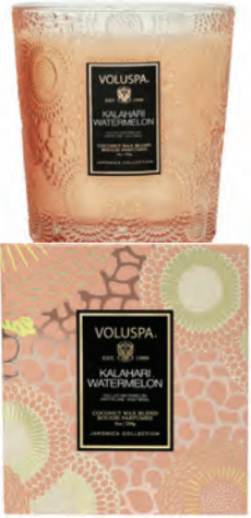
CLASSIC CANDLE #73427