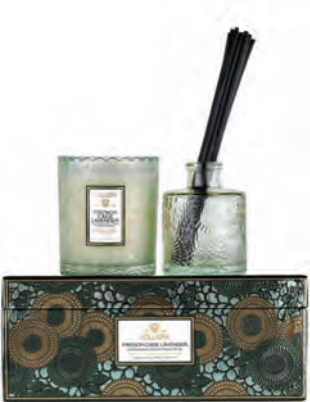
FRENCH CADE LAVENDER #72932