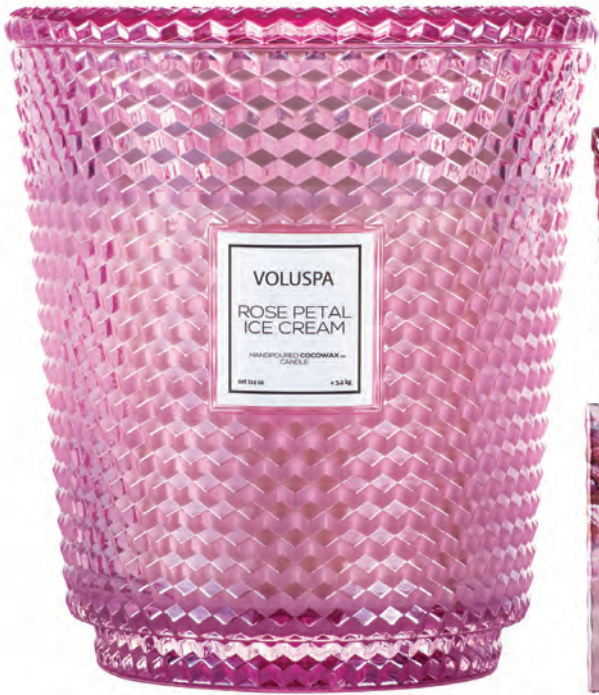
5 WICK HEARTH #5382