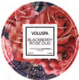
2 WICK TIN #5226