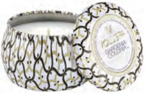
MINI TIN #8115