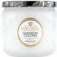
PETITE JAR #8145

This floral fragrance lifts with heady, exotic Gardenia Grandiflorum, Night Blooming Jasmine and Iris. Vapors of Blonde Wood and Amber embrace and mingle with this intoxicating floral bouquet - creating a sultry, fragrant cloud so smooth, the beauty and power of it's velvety aroma seems almost dreamlike.