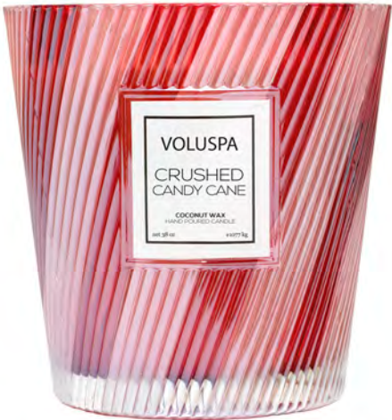
NEW! 3 WICK HEARTH #5426