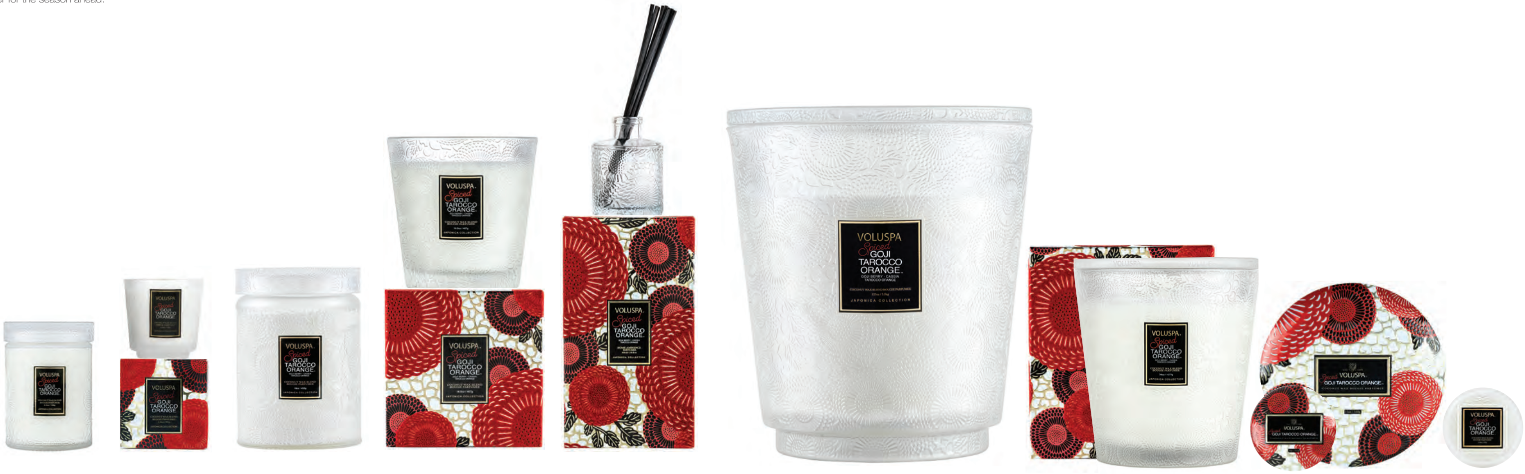
SMALL JAR #73518 MINI PEDESTAL #73918 LARGE JAR #73318 2 WICK HEARTH #73618 REED DIFFUSER #72518 5 WICK HEARTH #72818 3 WICK HEARTH #73818 MINI TIN #72118 3 WICK TIN 72218 MACARON #73118

This Holiday, the cult-classic fragrance you know and love gets a warm, seasonal refresh. Spiced Goji Tarocco Orange squeezes Red Tarocco Blood Oranges and Tangy Tangerines, while tartly bittersweet Pomelo juices are brewed with Spicy Cinnamon, Clove and star anise. This delightful holiday nectar will inspire joy and good cheer for the season ahead.