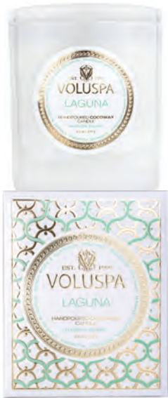
CLASSIC CANDLE #8103