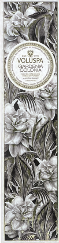
REED DIFFUSER #8155