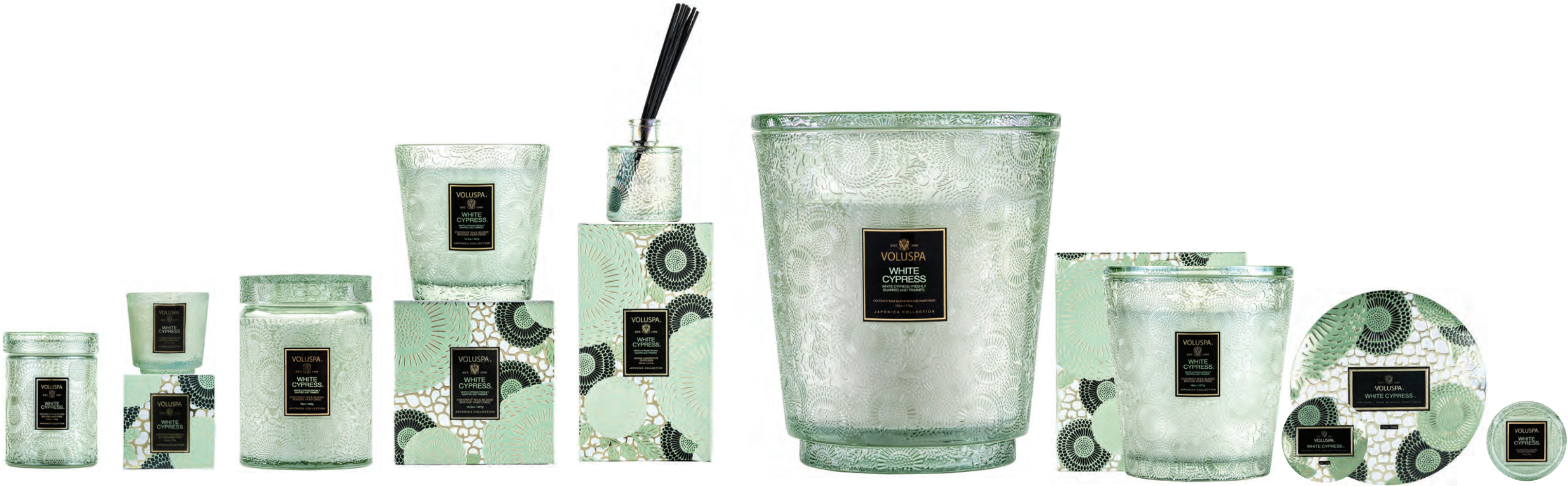
SMALL JAR #73519 MINI PEDESTAL #73919 LARGE JAR #73319 2 WICK HEARTH #73619 REED DIFFUSER #72519 5 WICK HEARTH #72819 3 WICK HEARTH #73819 MINI TIN #72119 3 WICK TIN 72219 MACARON #73119

White Cypress, a classic yet contemporary Holiday scent, captures a crisp walk in the winter woods. Frosted Bergamot and Minty Snowdrops perfectly envelop freshly cut Evergreen Cypress boughs and snow-kissed Sugar Plum. Bask in its glow while cozy inside.