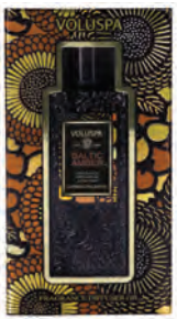
BALTIC AMBER Amber Resin, Sandalwood & Vanilla Orchid SKU 7413