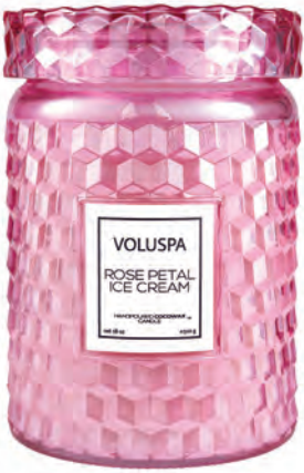
LARGE JAR #5352