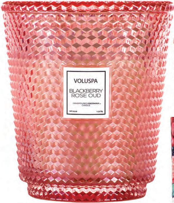
5 WICK HEARTH #5386