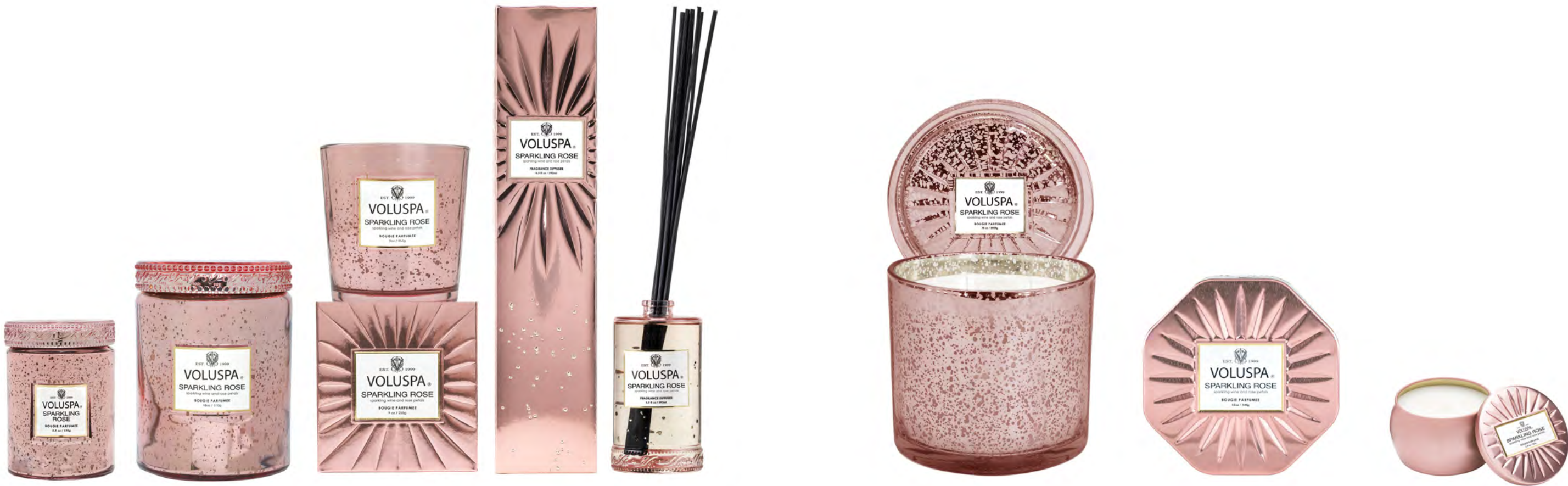
SMALL JAR #68711