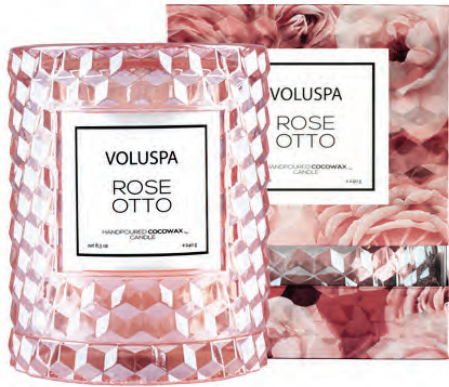
CLOCHE CANDLE #5321