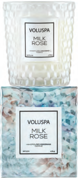
CLASSIC CANDLE #5315