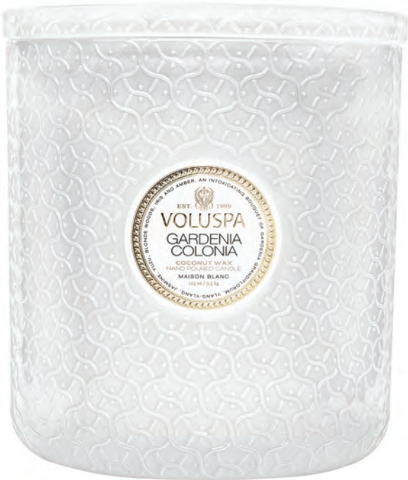
5 WICK HEARTH #8405