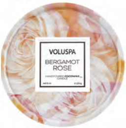
2 WICK TIN #5224