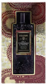
NEW! GILT POMANDER & HINOKI Golden Spiced Pomander, Holly Berries, Cardamom & Japanese Hinoki Bark SKU 74116