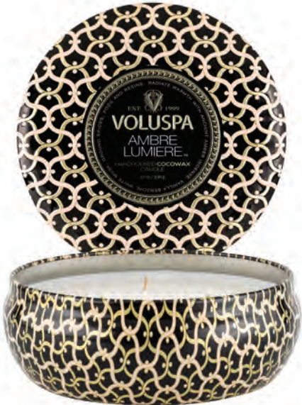
MINI TIN #8212