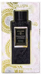
PANJORE LYCHEE Panjore Lychee, Cassis & Juicy Asian Pear SKU 7416