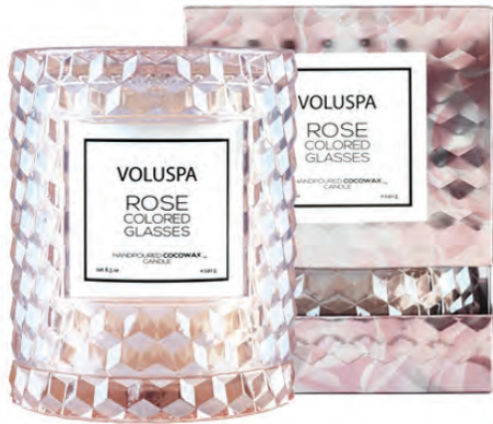
CLOCHE CANDLE #5323